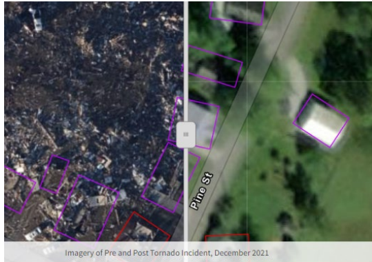
Imagery of Pre and Post Tornado Incident, December 2021

Have you always wanted to serve during a mission, but felt you don't get the opportunity because there are no disasters where you live, you don't fly, or you're not a member of a specialized team? Hopefully you read the recent article on Harnessing Technology in the spring edition of Volunteer Magazine . If you're interested in supporting FEMA conduct imagery-based damage assessments, you now have the opportunity. On behalf of the CAP Geospatial Program, all CAP members, including our international squadrons are eligible to apply and help. Click FEMA Damage Assessment Training to go to the webpage on the CAP NHQ website to